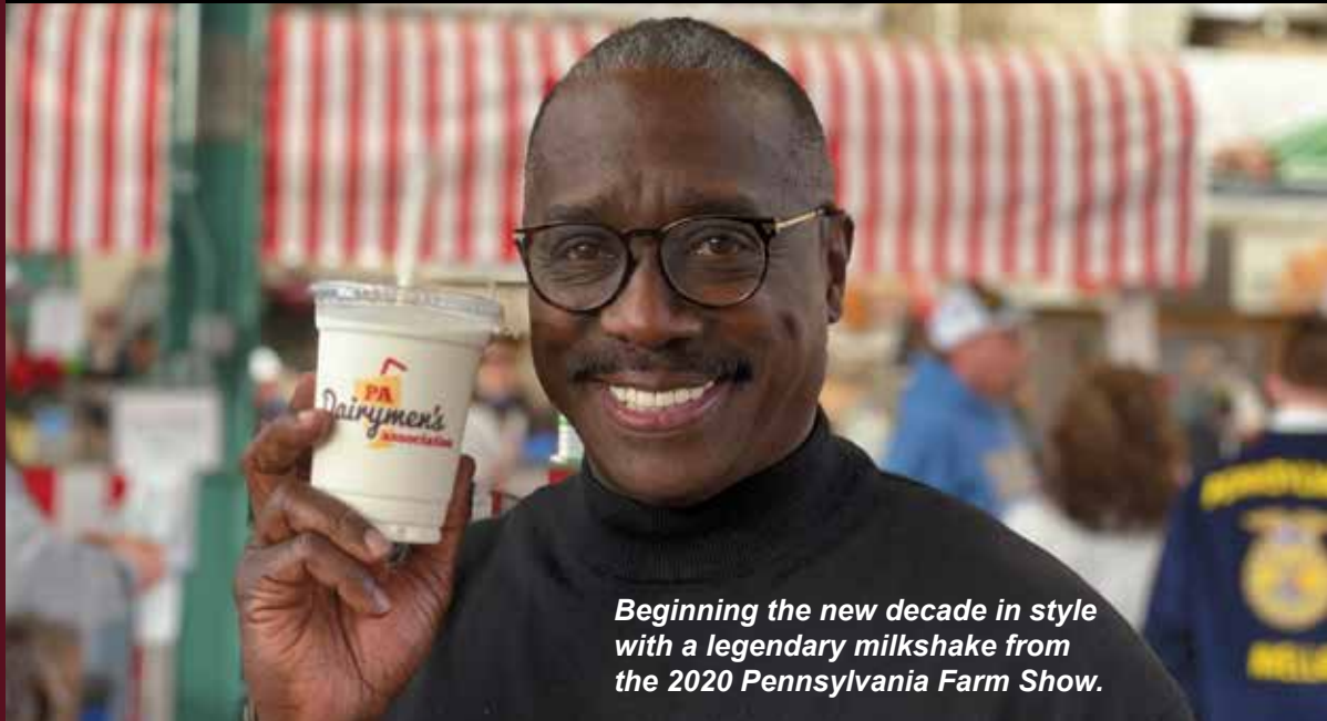
Beginning the new decade in style with a legendary milkshake from the 2020 Pennsylvania Farm Show.